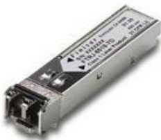
Small Form Factor Pluggable GBIC

When using multiple drives within a tape library multiple ParanoiaFF units can be utilised.